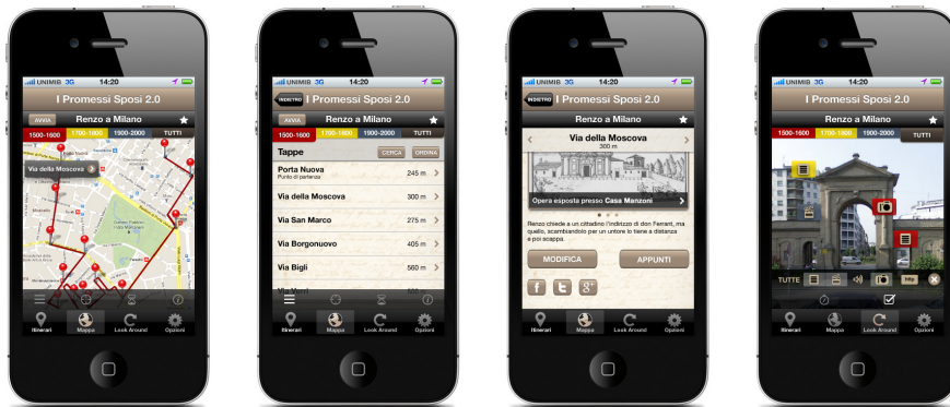
Fig. 2. Map view, look around and social features of the app

The application has a function (a Look Around) that exploits the Augmented Reality markerless ie without the use of external markers. At the points of interest that make up the route is shown on the display of the device, a label with the name of the place, and a button to view the data in-depth. Are also proposed a series of comics that indicate the existence of one or more multimedia content associated with the area that you are framing with the camera of your smartphone. The display also shows the direction to follow to reach the next stage of the route.